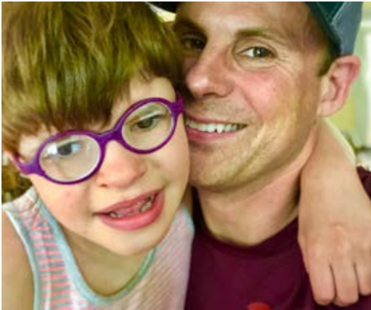
The author with his daughter